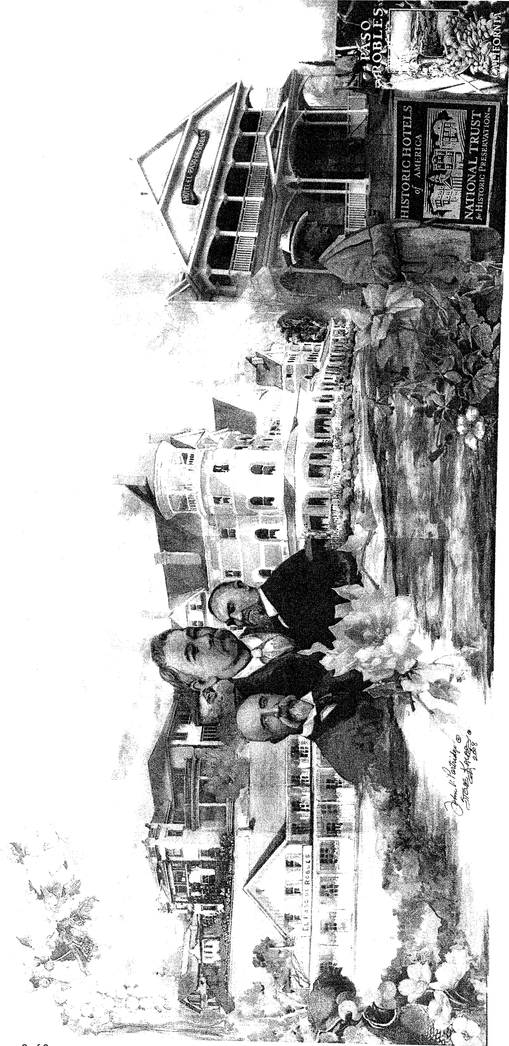
Attachment 1 Mural Design Misc. 08-002 (PR Inn Mural)